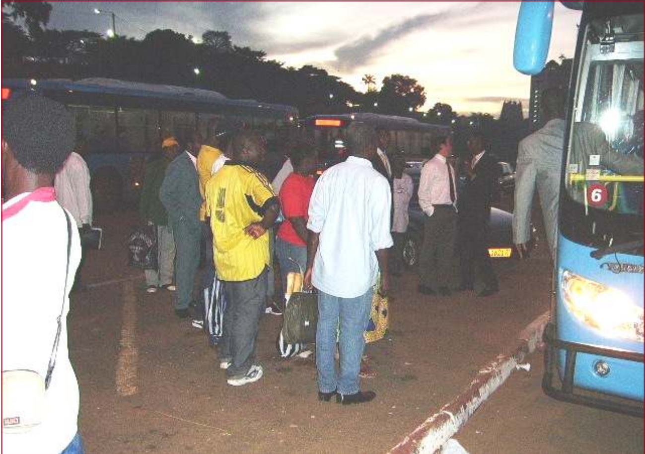
Riders waiting to board the bus

The Management of Le Bus has warmly received the good news coming from Line 8 as it confirms the expectations stated in the Business Plan. Le Bus remains confident that as more lines are opened in Yaoundé, more Cameroonians will become relieved by the services offered by the comfortable buses.