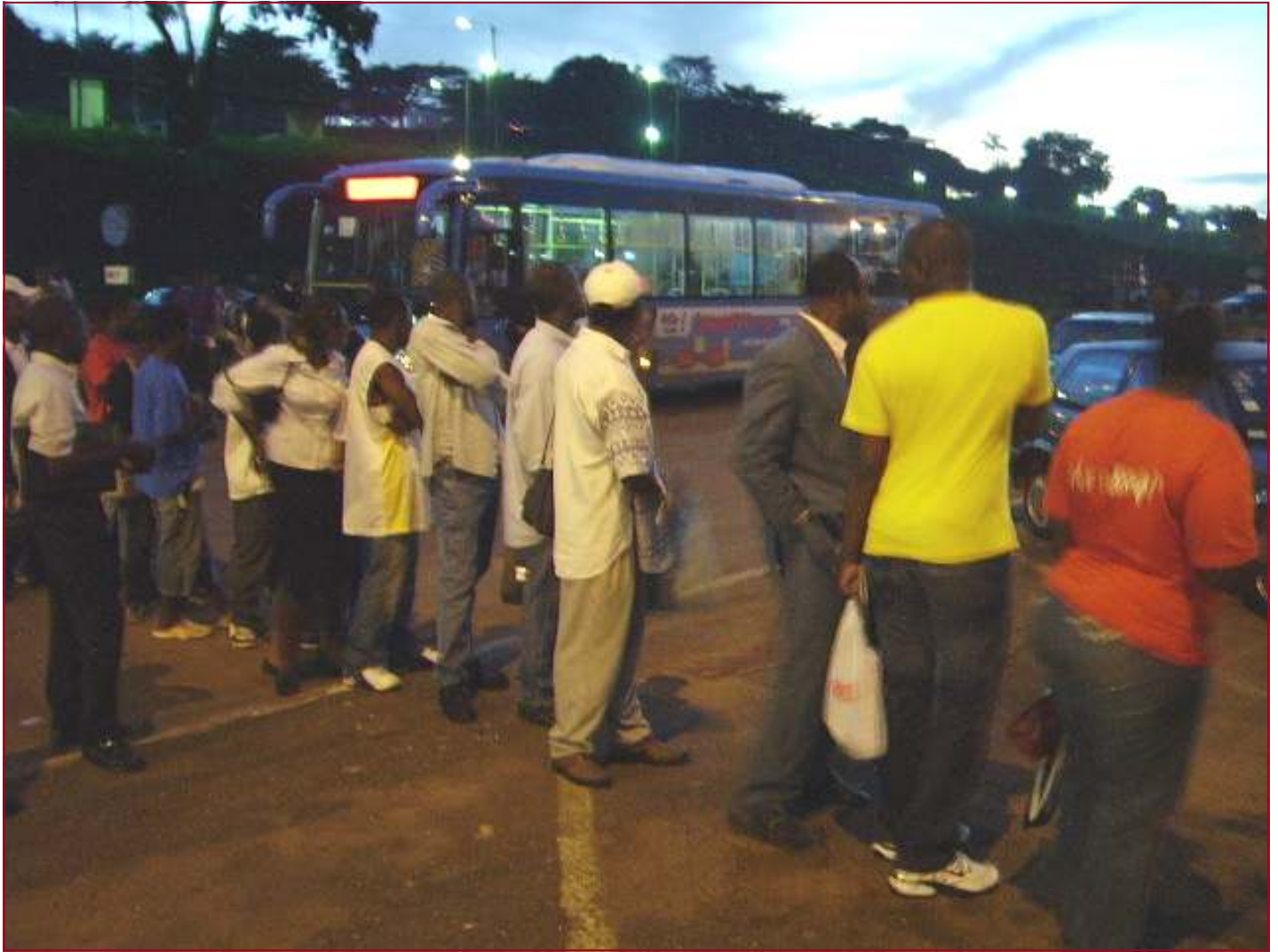
Waiting riders on the line turn to admire another bus